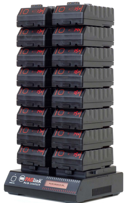
2-position PL16 charger (Model 9707).