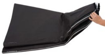
1.) Unpack and unfold the SNAPBAG® OCTA 7.