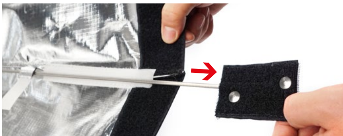
3.) Release the Velcro® strips.