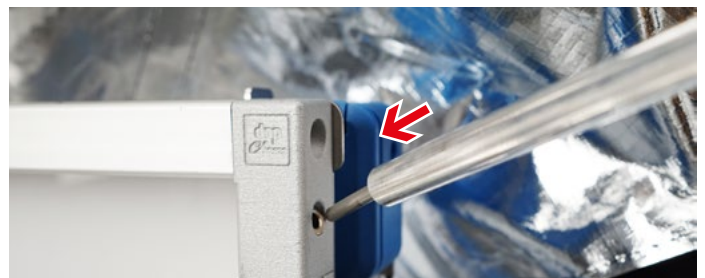
4.) Push in the 2 upper rods first to the RABBIT-EARS® – continue with all other rods.